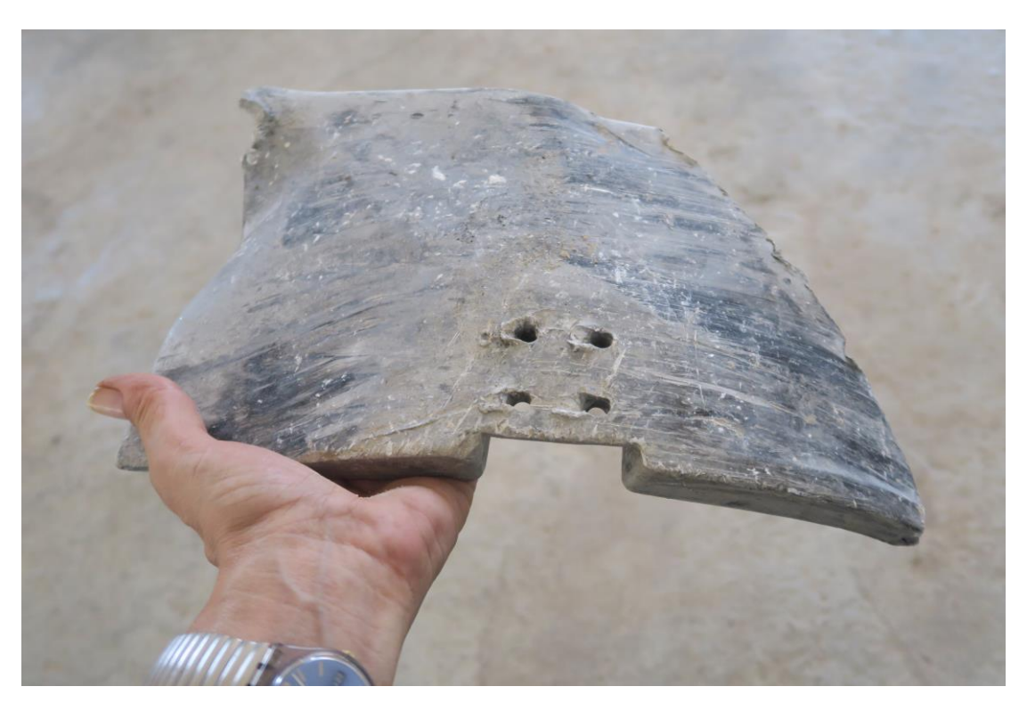
Fragment of a guidance fin from an American-designed Joint Direct Attack Munition (JDAM), which is a GPS-guided air-dropped bomb. From one of the bombs used in an air strike in Hukumya/Salhiya area northwest of Raqqa killed 14 members of a family and severely wounded two others on the evening of 11 May 2017. Eight of those killed in the attack were women and five were children. The two who were wounded were both children.

Amnesty International researchers visited the site and from the pattern of destruction there seems little doubt that the house was destroyed by air strikes. At the site, the organization's researchers recovered a fragment which weapon experts identified as a guidance fin from an American-designed Joint Direct Attack Munition (JDAM), which is a GPS-guided air-delivered bomb.<sup>28</sup> It is however not clear why the house was targeted. According to the two survivors of the strike, two children aged 14 and 15, no one was in the house other than the family members who lived there – eight women, seven children and one man. Amnesty International could not establish whether IS fighters might have been hiding in or launching attacks from the fields around the house before/at the time of the strike. However even if this was the case, it would not have constituted ground for targeting a house full of civilians.