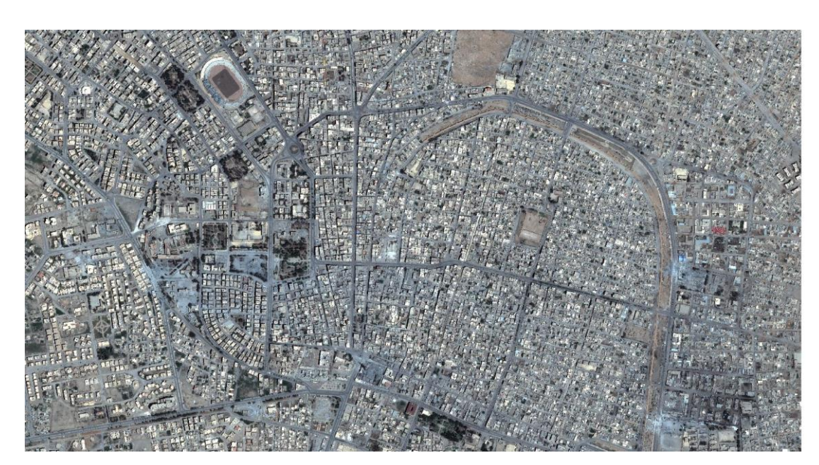
Raqqa Old City overview. Imagery taken on 2 June 2016.