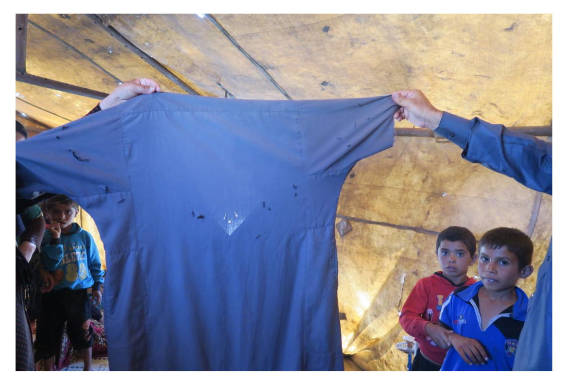
Survivors of cluster bomb attack by Syrian government forces in diplaced people's shelters south of Raqqa show Amnesty International clothes torn by cluster bombs shrapnel. @ Amnesty International

Amnesty International that the message was clear; they would be safe by the water. With the threat of imminent attacks on their towns and villages, residents fled, with many ending up in makeshift camps between the Euphrates and its subsidiary irrigation canals. However, those shelters too soon came under attack.