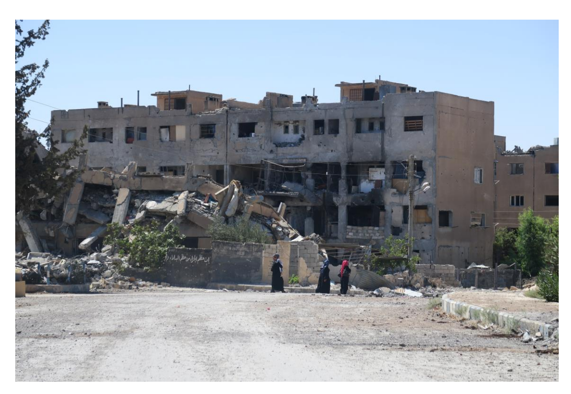
Families displaced by the conflict in Raqqa look for shelter in abandoned apartments in damaged and unsafe buildings in nearby towns previously recaptured from ISIS.

Notwithstanding these challenges, and in fact because of them, it is imperative that all the parties to the conflict take all feasible precautions to minimize harm to civilians; fully comply with the rules of international humanitarian law in the planning and execution of strikes and attacks - including by cancelling attacks that risk being indiscriminate, disproportionate or otherwise unlawful, and ending the use of explosive weapons with wide area effects in populated civilian areas, in compliance with the prohibition on indiscriminate or disproportionate attacks.