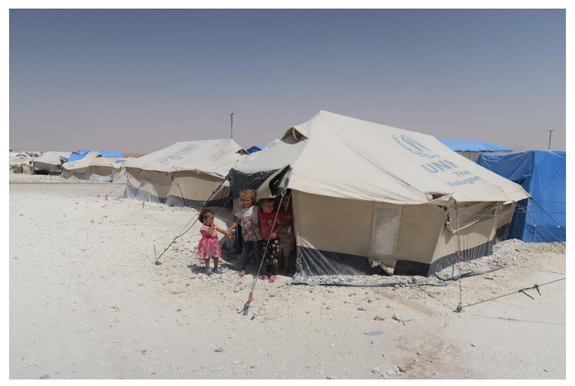
Children displaced by the battle in Ragga sheltering in IDP camp in Ain Issa, northern Syria.

Syrian government forces lost control of Raqqa City to armed opposition groups including Ahrar al Sham and Jabhat al-Nusra in early March 2013, making Raqqa the first Syrian provincial capital from which government forces were expelled entirely since the beginning of the uprising in 2011. After a brief power struggle with other armed groups, by the end of 2013 the IS had taken full control of the city, which it held until June 2017, when the ongoing military operation to recapture the city was launched by the SDF and US-led coalition forces.