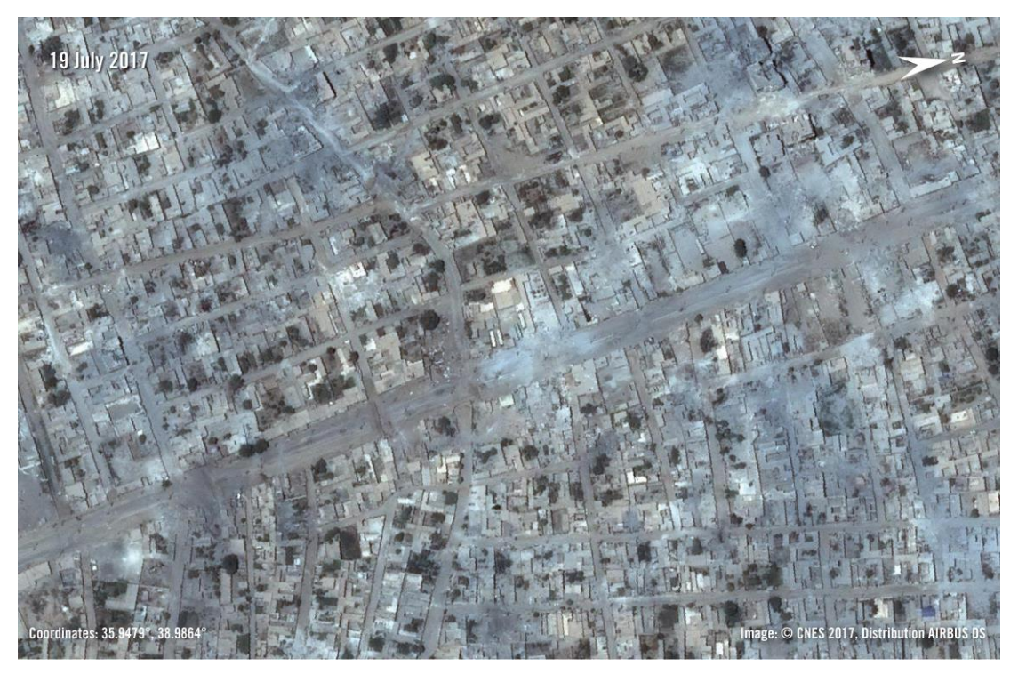
Raqqa, Ihsewa crossroad area. Imagery taken on 19 July 2017 after a series of strikes launched on 9 June. Coordinates: 35.9479°, 38.9864°.

It all happened in the space of a few minutes, sometime between 1 and 2pm, the shells struck one after the other. It was indescribable, it was like the end of the world – the noise, people screaming. If I live a 100 years I won't forget this carnage. Artillery shells are hitting everywhere, entire streets. It is indiscriminate shelling and kills a lot of civilians".<sup>21</sup>