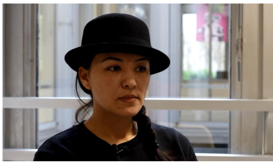
"When they told me: 'you're safe now, in France' I responded: 'I don't feel safe, even being in Europe'. I don't feel safe but I am not afraid."