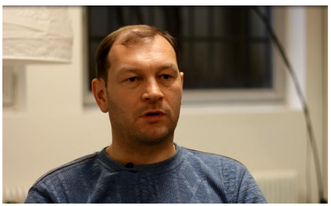
"There is now one less human rights defender in Uzbekistan ... I had to leave my home country and it is impossible to hold anyone responsible for that."